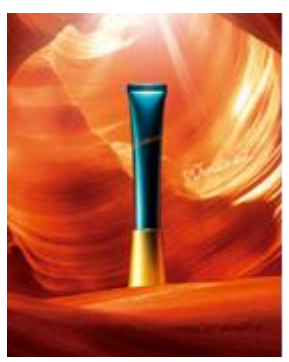
Wrinkle Shot Medical Serum

Wrinkle Shot Medical Serum will be available at the sales counters of the department stores below through face-to-face consultations.