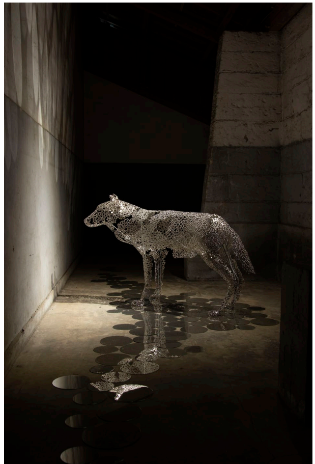
Top left "zui-un" 2022, Copper wire, BIWAKO BIENNALE 2022