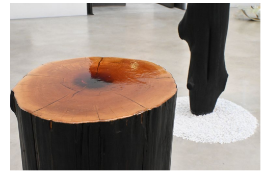
Mitsuki Akiyama 《What makes us Nature》 2022 Wood, colofonium, epoxy resin, gravel Installation

2022 "Metamorfosi della Natura" Civiche Raccolte D'Arte Palazzo Marliani Cicogna (Busto Arsizio, Italy) "Transitioning" HfBK Dresden (Oktagon, Germany)