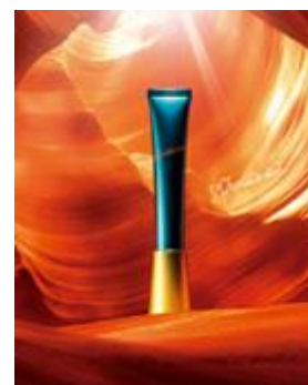
Wrinkle Shot Medical Serum

Wrinkle Shot Medical Serum will be available at the sales counters of the department stores below through face-to-face consultations.